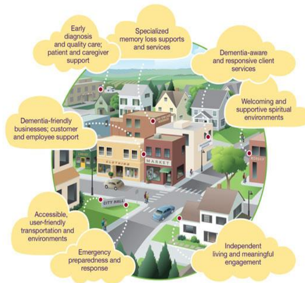
Figure 3.2: ACT on Alzheimer’s Dementia-Friendly Community Resources 25