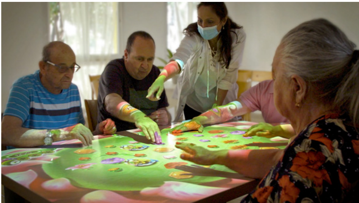
The Obie platform in use.

Obie is an interactive projector that can turn any floor, wall, or tabletop into a fully-interactive surface for multiple users. The device uses sensors to identify movements such as tapping, touching, or waving and hosts more than 200 games designed to help with physical exercise or cognitive skills. The colorful and animated games incorporate different needs and can include memory tests, musical quizzes, or speed coordination challenges.