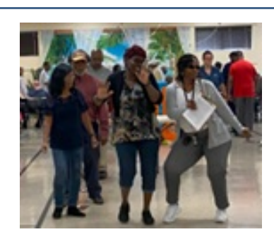
Wayne County Seniors