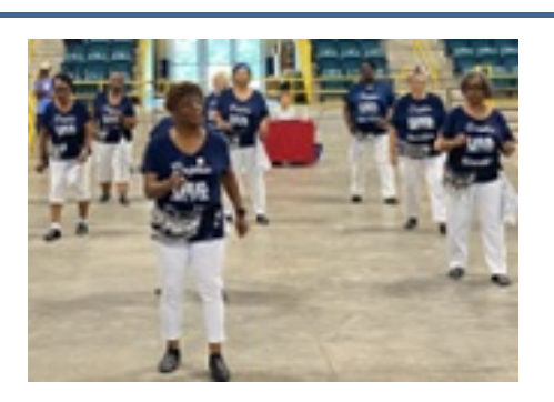
Duplin County Seniors