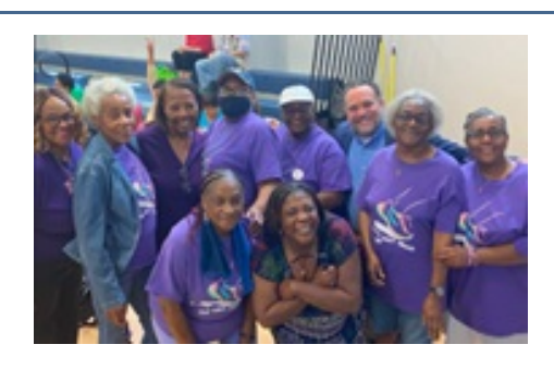
Greene County Seniors