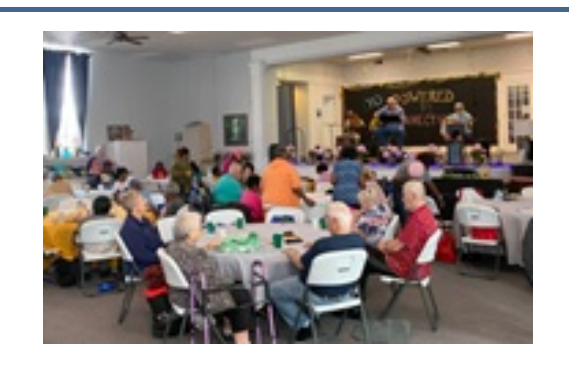
Craven County Seniors