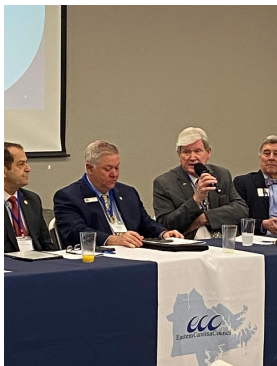
Rep. Jimmy Dixon