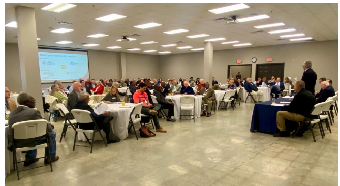
View of Legislative Breakfast Attendees