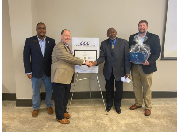
La Grange - Thank you!