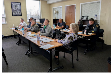
Kinston staff considered future goals.