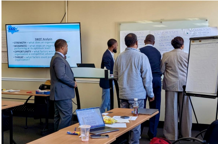
Kinston's leadership identified its goals through SWOT Analysis.